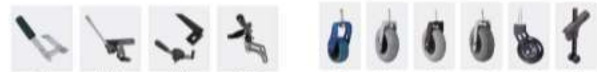
E94 E100 E101 E103 K25 K24 K22 K21 B9 B11