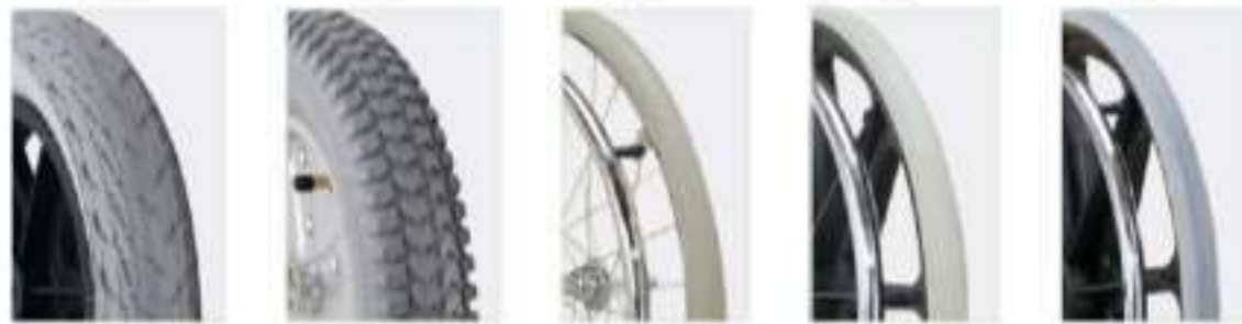
A32 A33 C38 C41 C42