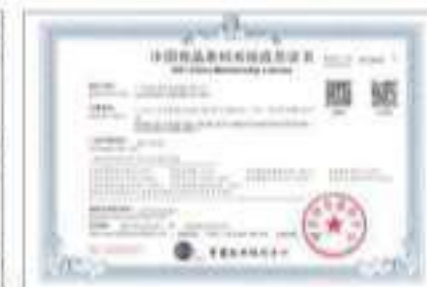
GS1 China Membership License