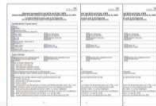
Electric Wheelchair, Walking Aids, Rollator, Manual Wheelchair Confirmation (00235773) (0028539) (00235772)