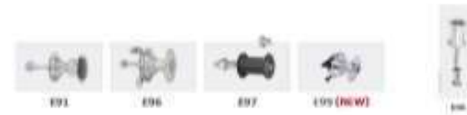
E91 E96 E97 E99 (NEW) E98

Technical specifications for various walker models, including models H100 through H106, F64(65) through F77, F78 through F89, E89 through E93, D57 through D63, E94 through E103, K25 through K21, B9 through B11, E91 through E97, and E99 (NEW).