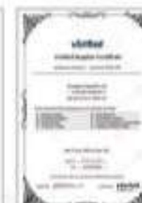
Intertek (20091795, T1)