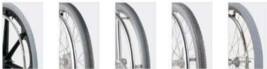
C37 C45 C44 C46 C36