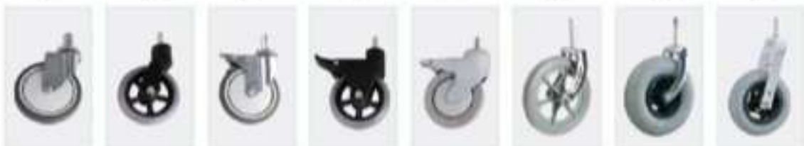
B15 B17 B18 B19 B20 B6 B7 B12

Technical specifications for various wheelchair models, including models A5 through A26 and B15 through B20. The text is small and dense, listing various specifications for each model.