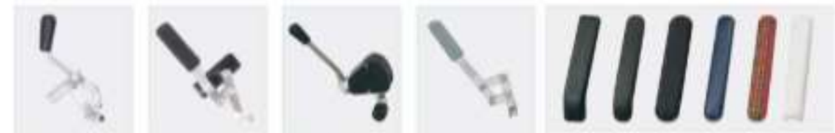
E89 E90 E92 E93 D57 D58 D59 D60 D61 D63