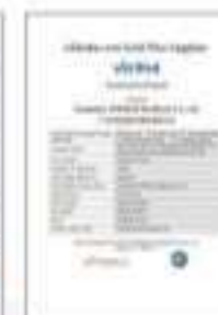
TUV (17425547, T2)