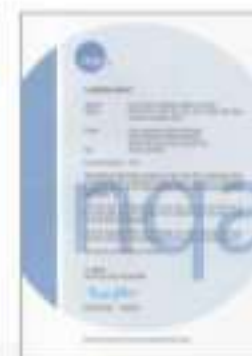
CE (No. 02515)