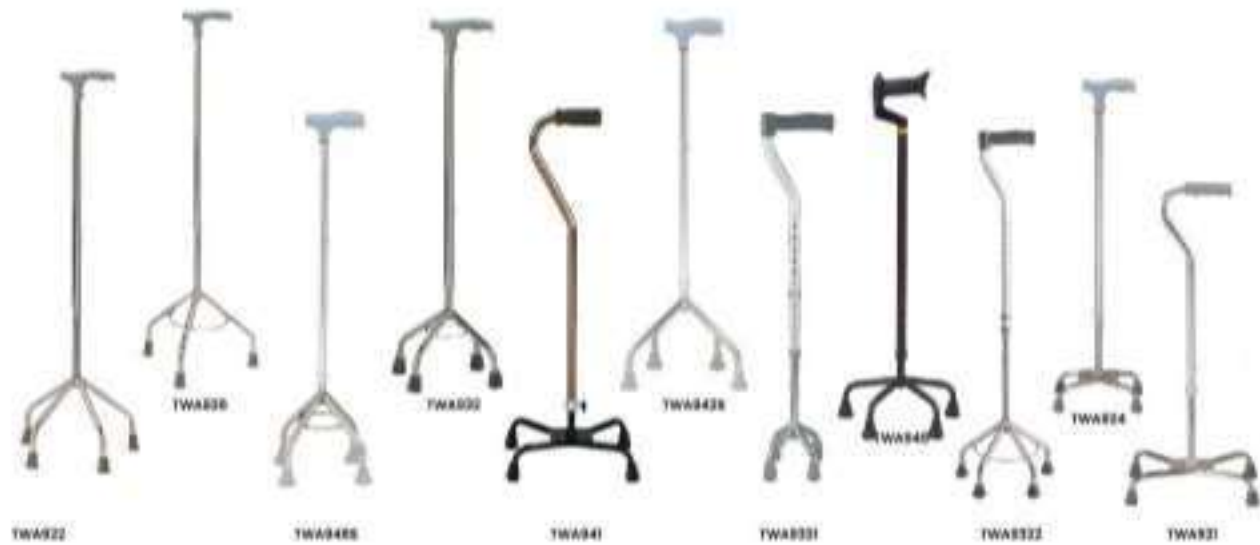
TWA922 TWA9485 TWA941 TWA9331 TWA9322 TWA921