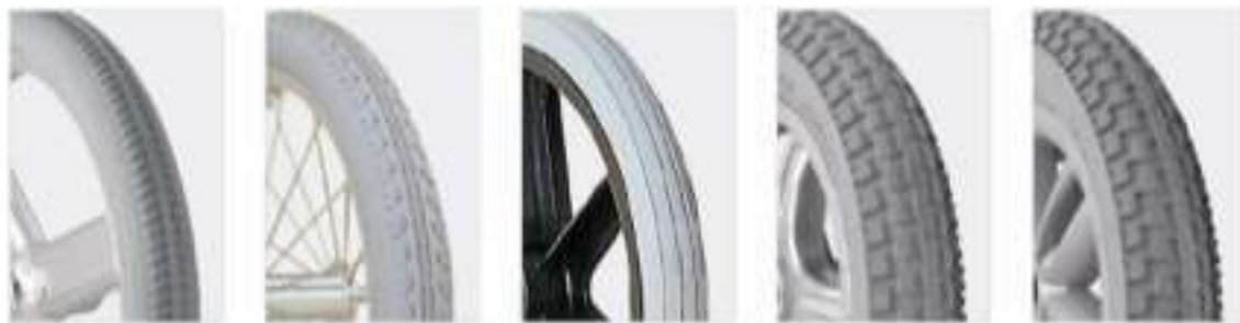
C43 A29 C33 A30 A31