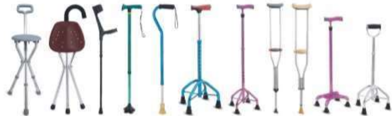
TWA912L TWA918L TWA9275L-W TWA921L-6 TWA9258L TWA9418L TWA9414L TWA9251L TWA9258L TWA9243L TWA9412L