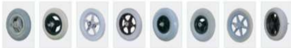
A5 A6 A7 A8 A21 A22 A23 A26