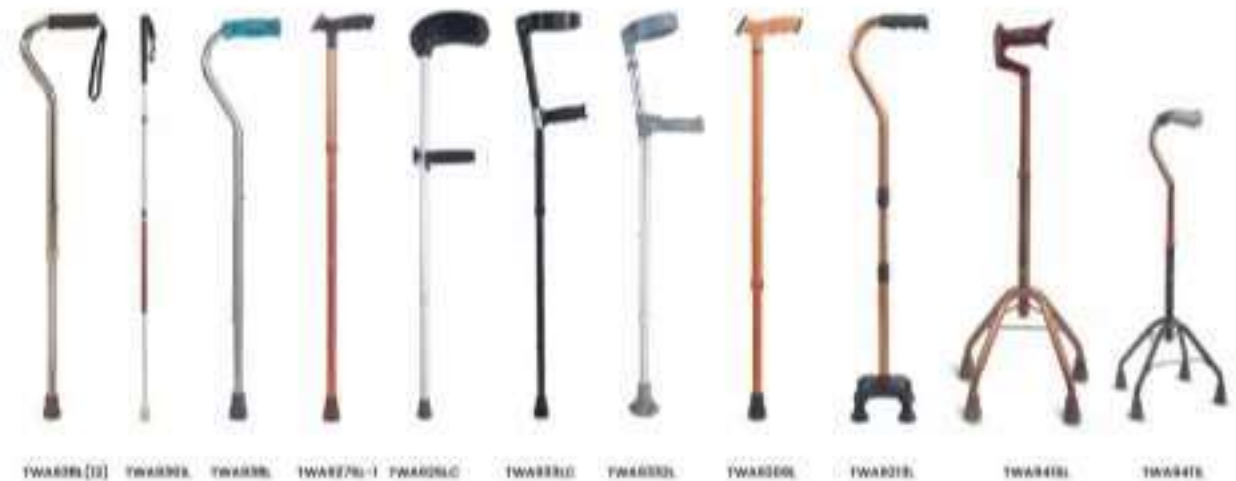
TWA938L (2) TWA938L TWA938L TWA9275L-1 TWA925LC TWA9331C TWA9331L TWA9208L TWA9218L TWA9418L TWA9418L