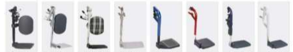
F64(65) F66(67) F68(69) F70(71) F72(73) F74 F75(76) F77