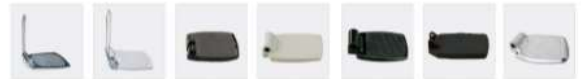
F78 F79 F80 F81 F84 F85 F89