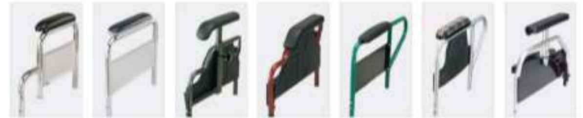
H100 H101 H102 H103 H104 H105 H106

Technical specifications for various wheelchair models, including models A5 through A26 and B15 through B20. The text is small and dense, listing various specifications for each model.